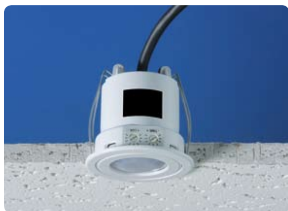
Figure 1 Ceiling flush mounted PIR Occupancy Switch with adjustable time lag function