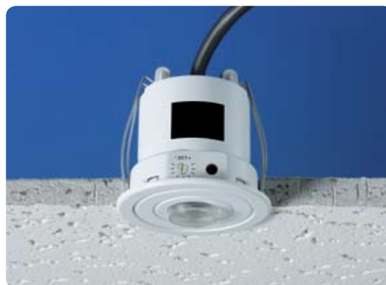
Figure 2 Ceiling flush mounted photocell switch